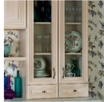
Glass insets and add an element of old world charm.