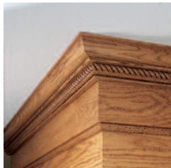
Decorative Crown and Rope moldings together create a furniture styled design.