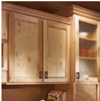
Wall cabinet with appliance garage creates a clever space to house those bulky small appliances.