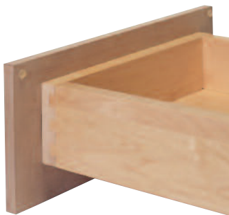
Superior drawer box construction. Solid hardwood sides, dovetail joints and fully captured bottoms with completely self aligning, fully concealed drawer glides.