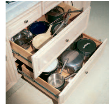
Innovative organizational solutions that provide instant accessibility.